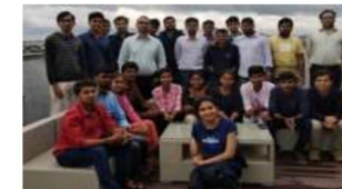
WildBeeS BSBS MBA 2017 - 19

All these companies (who are patrons of BSBS-trained talent) have been demanding talent with Data Analytics Skills :)